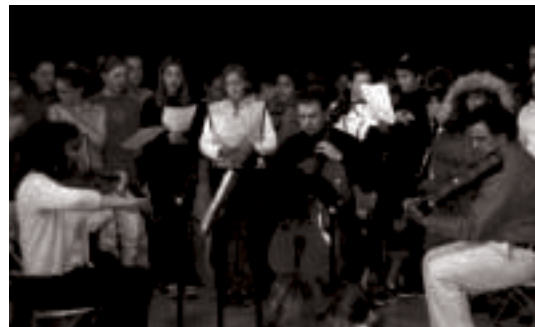
Richmond Consolidated School students performing with WCP at a recent outreach program.

students in various moments in history and different cultures. The musical examples, ranging from Chilean folk songs to Shostakovich's 8 th string quartet and Rap encourage the students to make the connection between music and their own social history. The response from students and teachers alike to Music and the Social