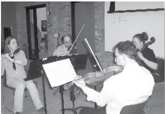
Left, a student rehearses with Walden members in preparation for the concert.

“The Chamber group created a customized curriculum in Elizabethan music and art to complement a Shakespeare unit in our humanities curriculum: Morely, Gibbons, sonnets, Tudor portraits on the big screen, lamp light—an exquisite synthesis of dramatic reading and music by Academy students and Walden Chamber musicians. Months later the parents and students in the audience are still applauding the evening, asking when there'll be more.”