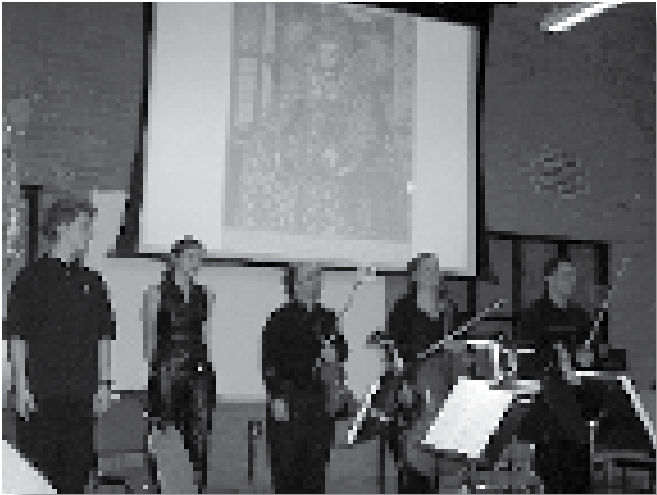
Above, students and Walden Chamber Players musicians in concert at the "Brickyard", the Academy's performance space.

We are very excited to return to the Academy in an expanded residency next season which will have us at the school for two visits in November 2005 and March 2006. Our increased presence at the academy will allow us to really become part of the school community and will produce an even more fruitful and productive dialogue between the students of the Academy and the musicians of WCP. Each residency will culminate in a concert featuring the students in collaboration with WCP members.