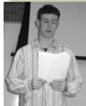
Work in progress (above and left)—the process of putting together the humanities presentation, "Thou art all my Art", the Elizabethan age in music, poetry, and image.